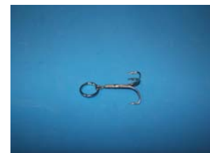
H&L 270 Treble Hook Qty 2