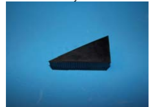
H&L 414 Door Wedge Qty 2