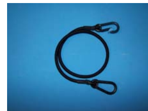
H&L 650 Strap Bungee 6 1/2" Qty 1