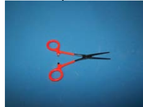
H&L 350 Seizer Clamp Qty 1