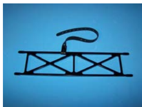
H&L 590 Flat rope Ladder Qty 1