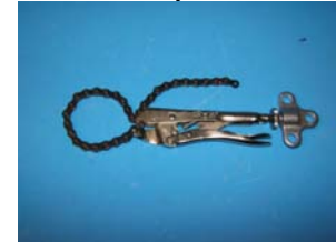
H&L 370 Locking Pliers, Chain Qty 1