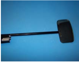
H&L 820 Mirror for Pole Qty 1