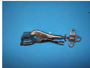
H&L 320 Locking Pliers, 4 Jaw Qty 1