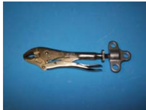
H&L 310 Locking Pliers, STD Qty 1