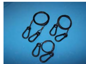
H&L 630 Strap Wire 1/16" Qty 1