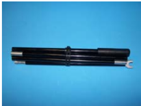
H&L 280 Sectional Pole Qty 1