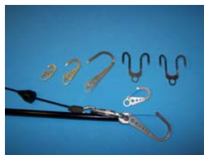
H&L 220 Hook 1/2" Qty 1 H&L 225 Hook 1" Qty 1 H&L 230 Hook 2" Qty 1 H&L 240 Hook 1" w/Latch Qty 1 H&L 245 Hook 2" w/Latch Qty 1 H&L 260 Hook 1" Twin Qty 2