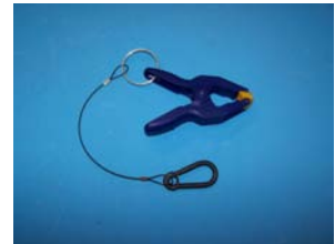
H&L 330 Light Clamp Qty 1