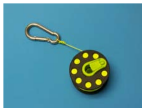
H&L 600 Compac Reel Qty 1