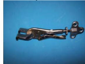
H&L 360 Locking Pliers, Draw Qty 1