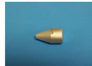
H&L 145 Split Trigger Qty 1