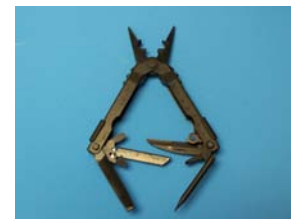
H&L 712 Gerber DET 600 Qty 1