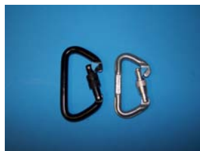
H&L 150 Carabiner 5/8" Qty 4 H&L 155 Carabiner 1" Qty 2