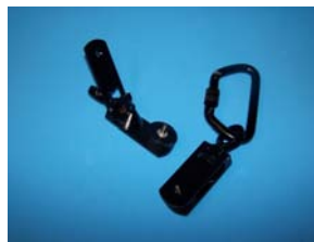
H&L 130 Snatch Block Qty 2