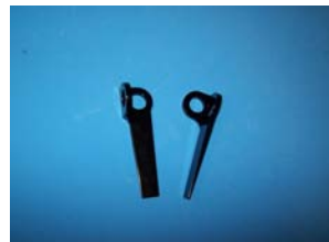
H&L 170 Piton Anchor Qty 2