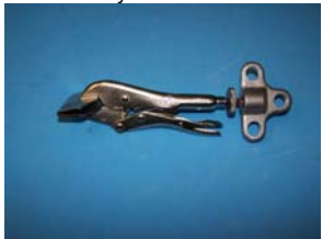
H&L 380 Locking Pliers, Flat Qty 1