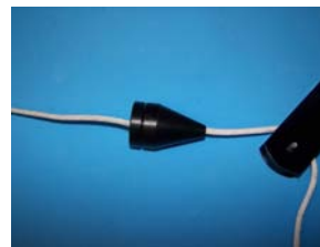
H&L 140 Trigger Qty 2