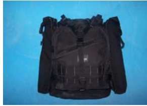
H&L 910 Case Backpack Qty 1