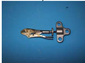
H&L 390 Locking Pliers, Small Qty 1