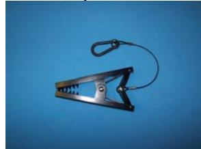
H&L 340 Alligator Clamp Qty 1