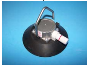
H&L 470 Suction Hook Qty 2