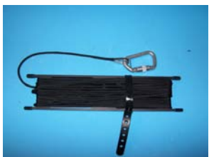
H&L 510 Primary Rope Qty 1