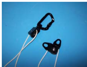
H&L 110 Split Pulley Qty 2